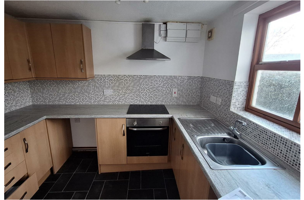
Coppice Lane, Castle Caereinion, Welshpool £750 Per Calendar Month

A newly decorated two-bedroom mid terrace home, located in Castle Caereinion which is a short drive from Welshpool, Powys.